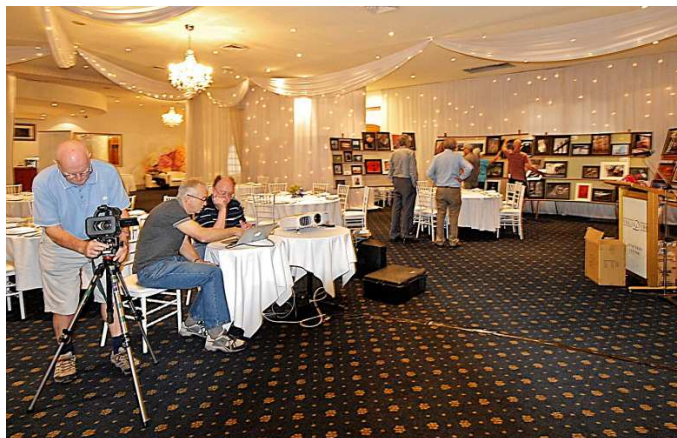
The Room is ready, all set up.