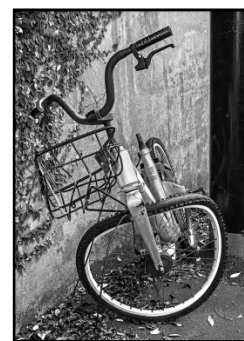
"A Sorry Ending"