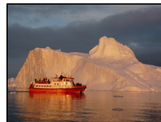
“Midnight Amongst the Icebergs” Monte Hunt 11 Entries Received