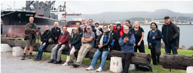
2021-01 Port Kembla Inner Harbour Twilight Outing.

So would January 2021 be any different? After all it is mid-summer, extended daylight resulting from the State's daylight saving time. What could go wrong? Would luck be on our side for the members to photography BlueScope Steel's Sinter Plant and the Discharge Berths? Across the Inner Harbour's channel are the Export Coal Loader and Grain Terminals. As we gathered, the ominous dark clouds rolled in, the wind increased and members could feel the slightest rain. Our final omen must have been a couple of members going to the wrong location, but with a little mobile coaching, they arrived in time for the Class Group photo.