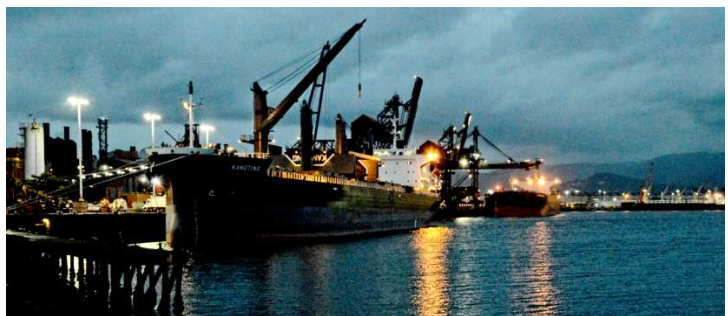
Discharge and Ore Berths (Bruce Shaw)

Later in the evening another change in the weather occurred, rain and wind. Some members decided to turn in for the night with a few hardy photographers continuing to look for photographic opportunities.