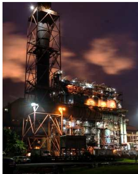
BSL's Sinter Plant Area. (Ruth Brooks)

Within minutes, this slightest rain feeling caused most members to hurry back to their cars for shelter from the heavier downpour. This weather soon cleared and the members came out to play again, looking for new angles, viewpoints to photograph the Steelwork's and Harbour structures along with the coming evening. Lighting from the buildings, shipping, the harbour front began to glow resulting in dancing light reflections in the water.