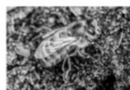
Honey bee Commended Simon Beaton