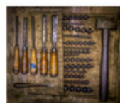
Old Tools Commended Tim Porteous