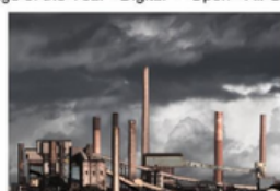
Clouds Over Works Image of the Year Vivienne Noble