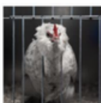
Clucking Furballs Commended Kati Childs