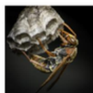
Wasp Commended Greg Powell